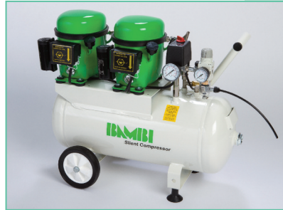
BB24D with optional wheel kit Part No. BPB0157