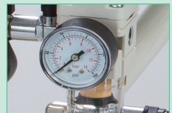
10 Micron Outlet Filter and Adjustable Pressure Regulator

Manufactured in the United Kingdom to exacting standards, each model is fully CE compliant, protected by our comprehensive warranty extending to 3 years on the air receiver and built by care from a company with over 40 years' experience in the compressor industry.