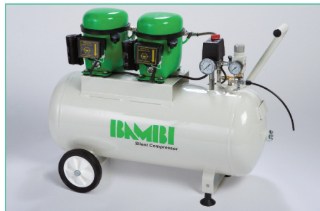
BB50D with optional wheel kit Part No. BPB0157