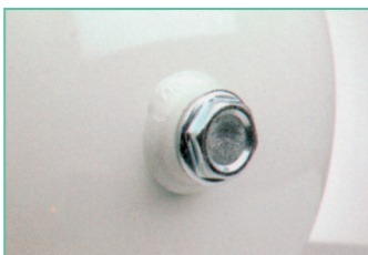
Internally Coated Air Receiver

Budget compressors are the ideal choice for powering laminating machines, staple guns, air brushing, exhibition stands, adhesive dispensing, testing equipment – anywhere where compressed air is needed silently!