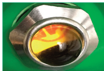
Clearview Oil Level Check